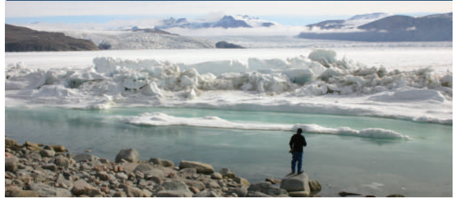
Antarctica - the source of the ZyGEM extraction technology (Granite Harbour, Ross Sea)